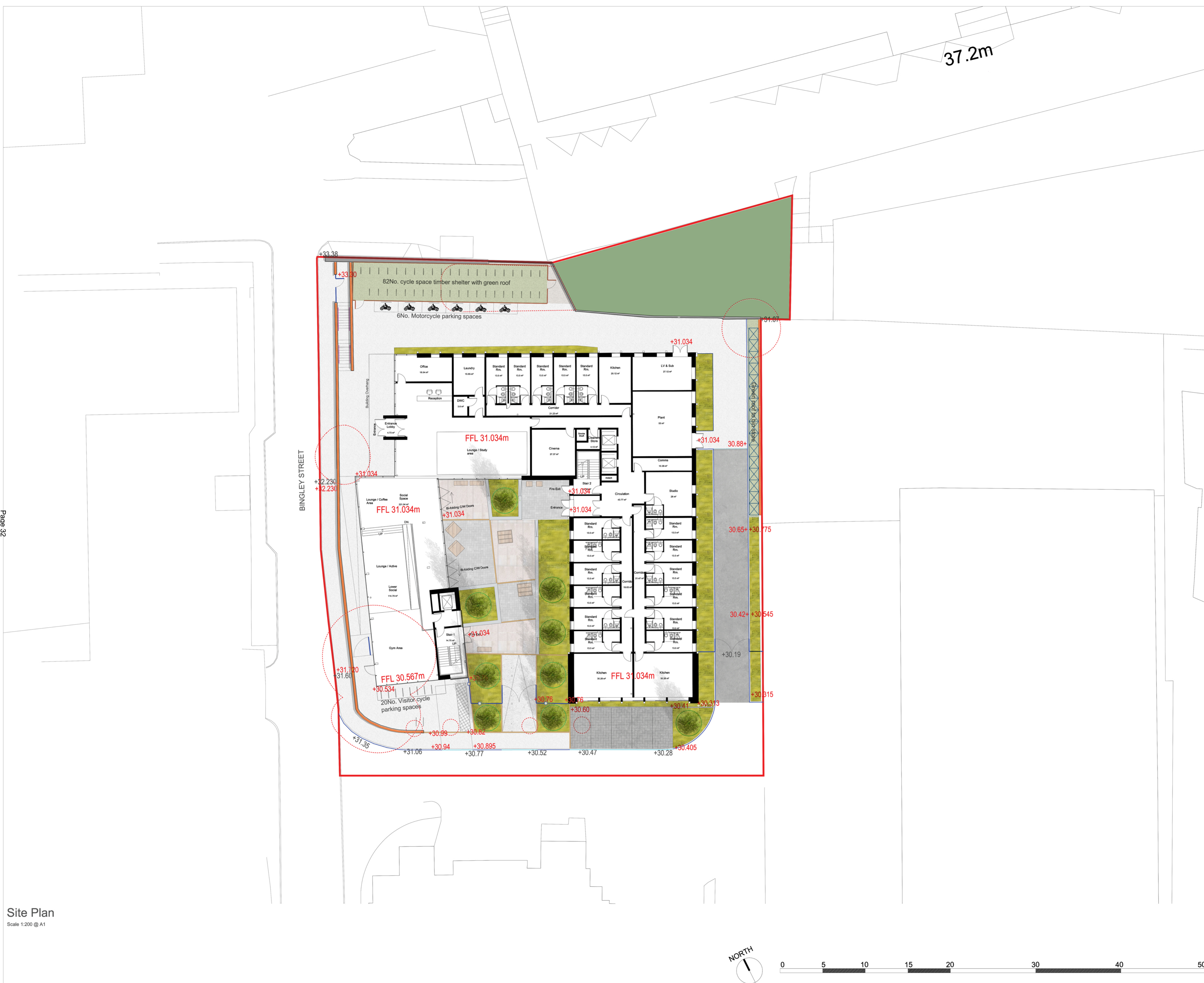
Site Plan Scale 1:200 @ A1